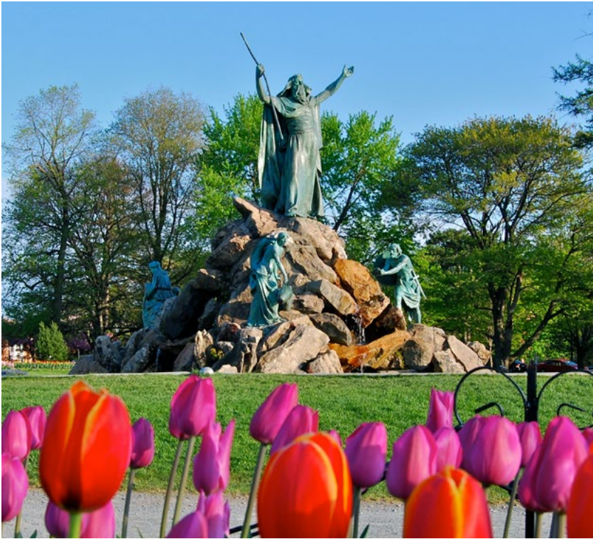
TULIP FEST AT WASHINGTON PARK, ALBANY