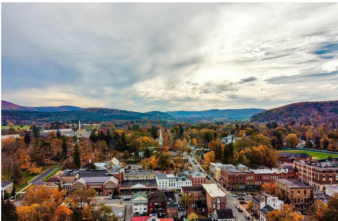
COOPERSTOWN, NEW YORK