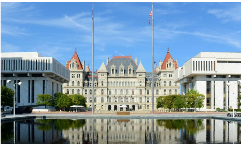
NEW YORK STATE CAPITOL BUILDING, ALBANY

For more information go to the Albany City Website , the Capital Region Chamber of Commerce , or the Albany City School District .