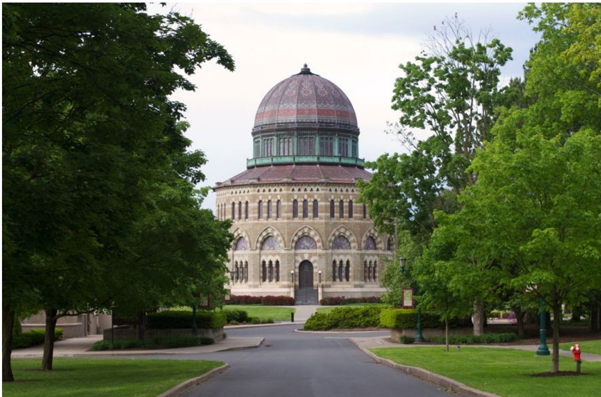
NOTT MEMORIAL AT UNION COLLEGE, SCHENECTADY

For more information, go to the city's website , the school district , or the chamber of commerce .