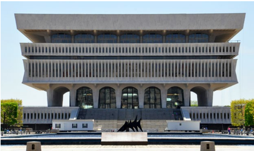
NEW YORK STATE MUSEUM, ALBANY

Do you spend your free time shopping, going to the theater, dancing at a club, visiting an art museum, taking a hike, kayaking, enjoying dinner out, going to an outdoor music venue? The Capital District has all that and more!