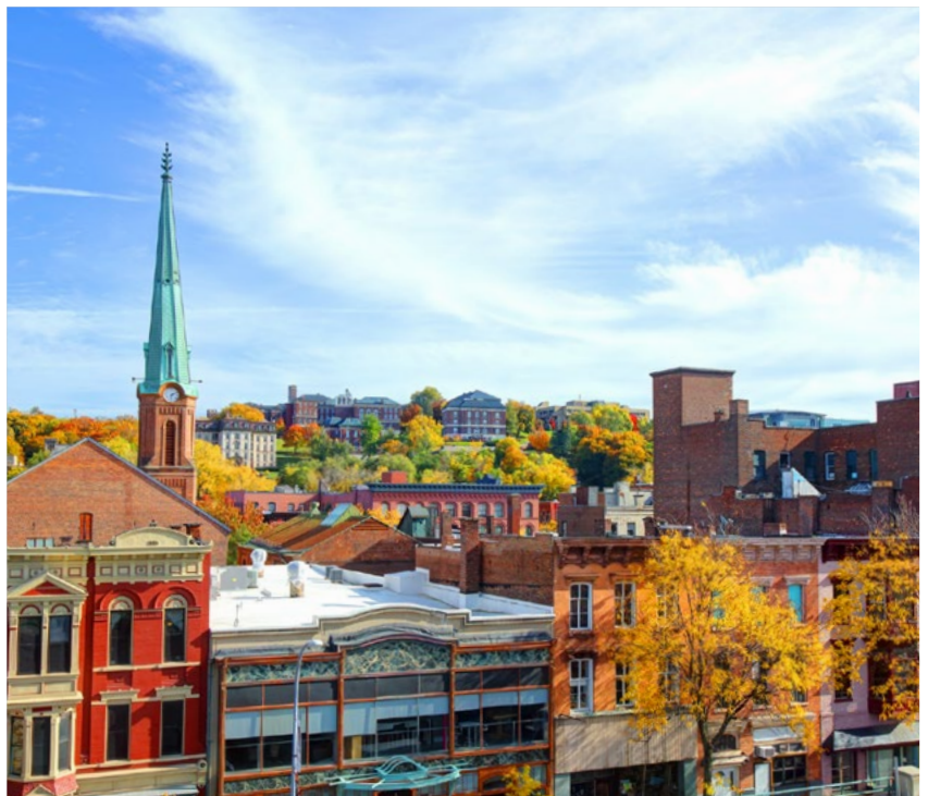
DOWNTOWN TROY IN AUTUMN

For more information, go to the Troy website , the Troy school district , Lansingburgh school district or the Troy Chamber of Commerce .