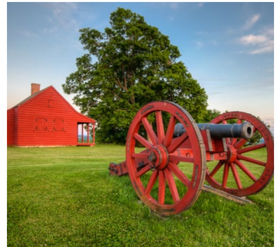
SARATOGA NATIONAL BATTLEFIELD