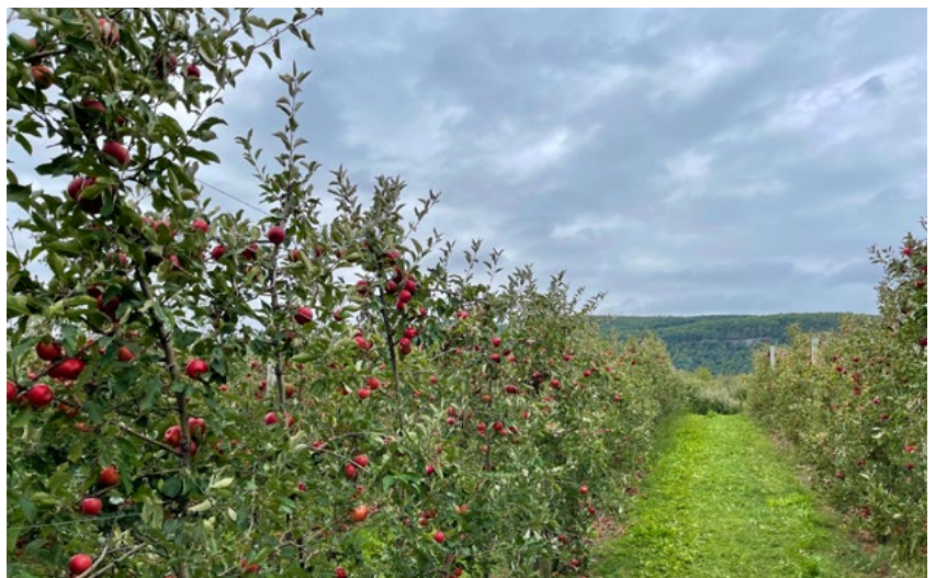
APPLE PICKING AT INDIAN LADDER FARMS

For more information, check out the Town of New Scotland , the Village of Voorheesville , or the Voorheesville school district .