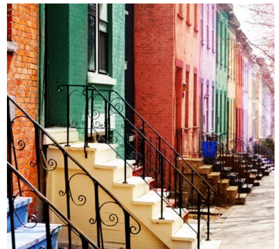
TOWNHOUSES ON LANCASTER ST, ALBANY