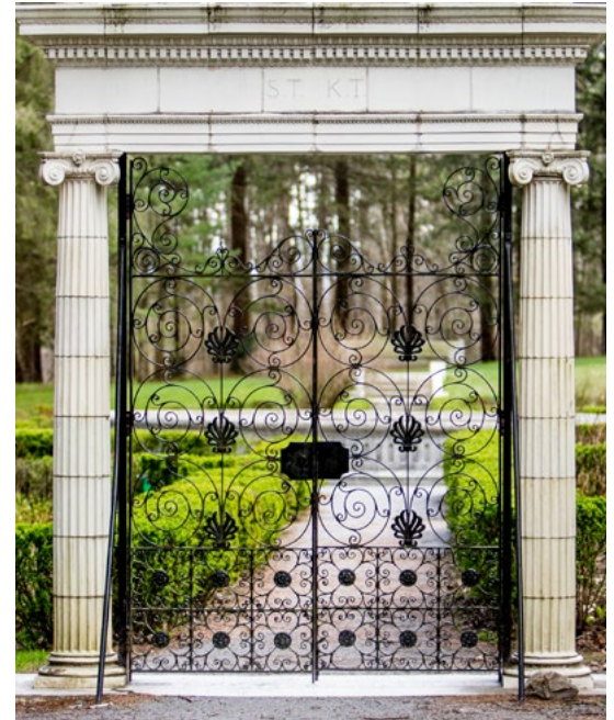
YADDO GARDENS, SARATOGA SPRINGS

For more information, go to the town's website or the chamber of commerce .