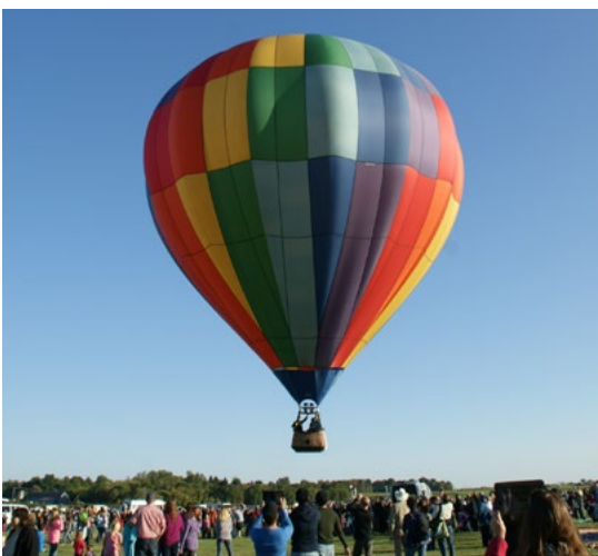
ADIRONDACK BALLOON FEST